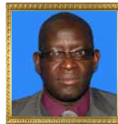
Hon. NSABIMANA Yves