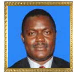
Hon. MULENGANI Bernard