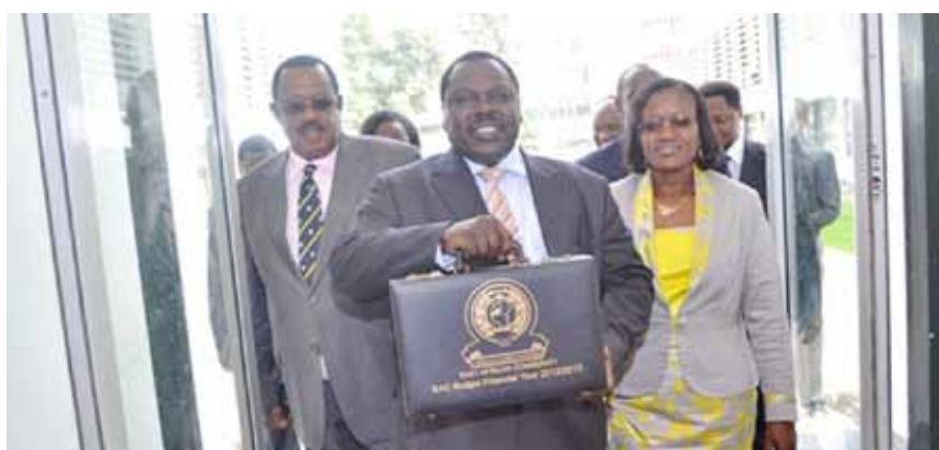
The Chairperson of Council of Ministers Hon Musa Sirma is ushered in by his colleagues, 1st Deputy Prime Minister & Minister for EAC, Uganda, Rt. Hon Eriya Kategaya and Minister for EAC, Rwanda, Monique Mukaruliza to read the EAC Budget. Accountability and transparency of public resources requires political goodwill

The 6 th EAAPAC General Meeting called upon Parliamentarians to work together to fight against corruption and mismanagement of public resources.