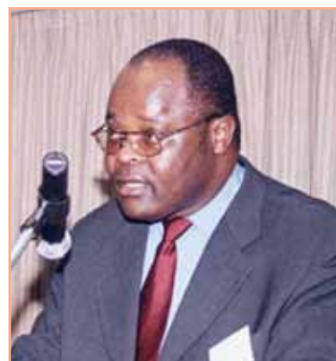
The late David Nalo (Kenya's former PS, Ministry of EAC)

Bw. Nalo offered true leadership and played a contributing role as the republic of Kenya firmed up its negotiating positions especially as the dateline for Customs Union negotiations loomed. David was also instrumental in developing Kenya