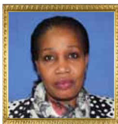
Hon. MOSSI Hafsa