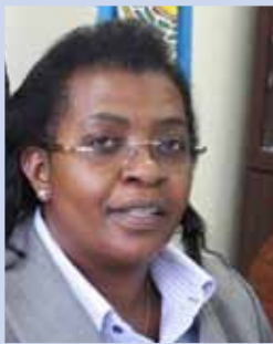
By Rt. Hon. Margaret Nantongo Zziwa