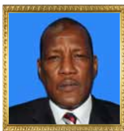
Hon. OGLE AbuBakr D. Abdi