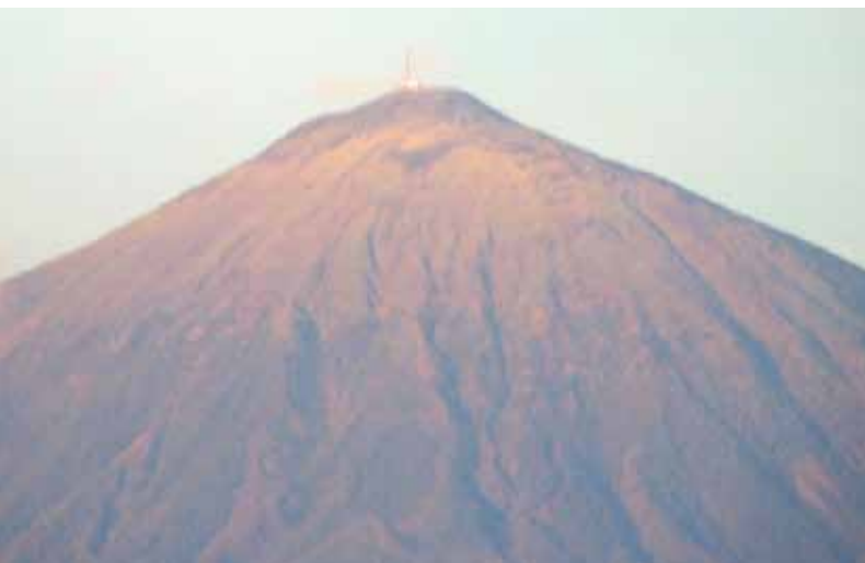
The volcanic Kalisimbi mountain

Integration, democracy and accountability are interlinked. Hence, quick mechanisms enabling legitimate and accountable decision-making need strengthening in order to create an integrated and democratic economic bloc. EALA and National Assemblies can play the role and help to address some of the issues of preparedness or conformity to the Treaty.