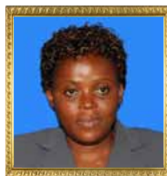
Hon. NDAHAYO Isabelle