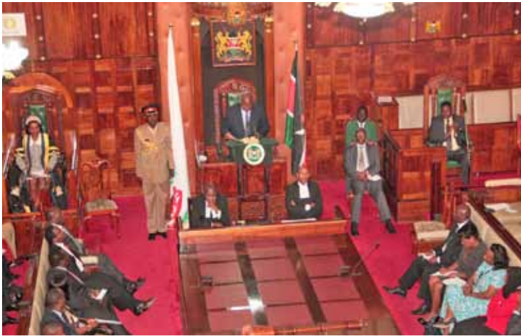
The Presidential address

She termed developments at the EAC during the period under President Kibaki as the Chair of the Summit of EAC Heads of State as progressive.