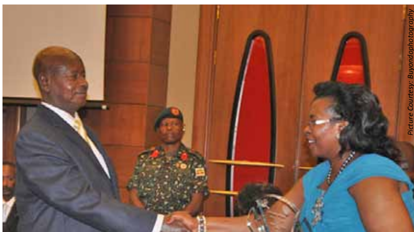
President Yoweri Museveni congratulates Rt. Hon Margaret Nantongo Zziwa upon receipt of the Independence Award of Uganda Women who have contributed to empowerment of women to the country

Uganda witnessed the most gruesome times of dictatorship, where even the religious were never spared, (Bishop Janan Luwumu), the learned also perished (Justice Benedicto Kiwanuka) and those with