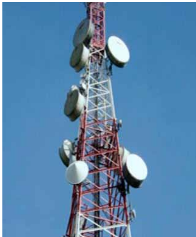
Kalisimbi Telecommunication project is expected to enhance communication in the region