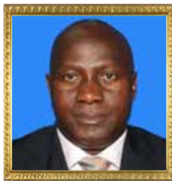
Hon. NGENDAKUMANA Jeremie