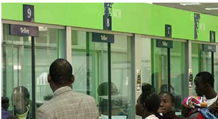
Clients wait to be served at a Kenya Commercial Bank branch. A single currency within the Community is a key towards an integrated financial framework

In the same vein, it shall create a paradisiacal East African Community, proud of itself, historical in Africa and exemplar in the world.