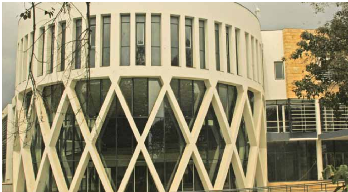
The new home that is the EAC

...It is a landmark episode in the furtherance of the integration agenda