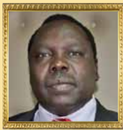
Hon. Musa Sirma, Minister for EAC Affairs (KE) and Current Chair of EAC Council of Ministers