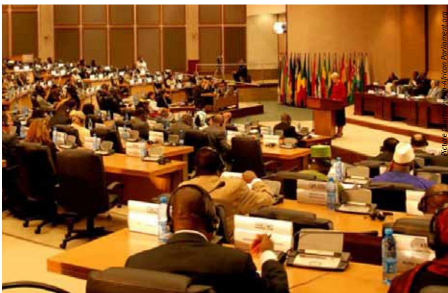
Participants at the Pan African Parliament (PAP) Speakers' conference held in Midrand, Johannesburg, South Africa

In Midrand, Johannesburg, South Africa, Speakers of the Regional and National Assemblies in the continent convened for the Pan-African Parliament (PAP) Speakers' conference held on August 30-31, 2012. The conference was called to consider the progress on the review of the Protocol establishing