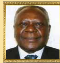
Hon. Samuel Sitta, Minister for EA Co-operation (TZ)