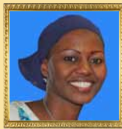
Hon. Léontine Nzeyimana, Minister for EAC Affairs (BU)