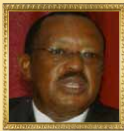
Hon. Eriya Kategaya, First Deputy Prime Minister & Minister of East African Affairs (UG)