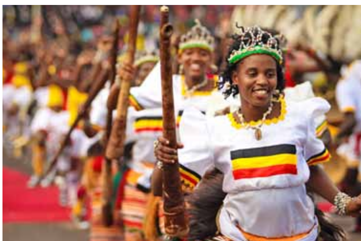
Pomp and colour during the nation's 50 th anniversary of independence

The occasion was graced by 13 Heads of State and the Duke of England who incidentally represented the