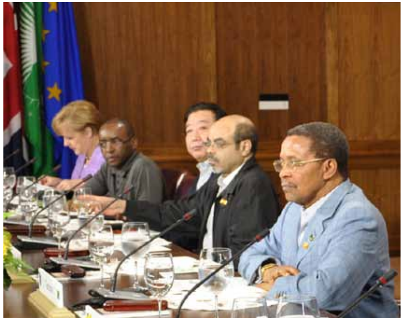
President Jakaya Kikwete, the late Prime Minister Meles Zenawi of Ethiopia, during the G-8 summit at Camp David in Maryland, USA

On the other hand, Premier Zenawi presided over the affairs of Eastern Africa's most populous nation when it was registering a double-digit economic growth coupled with a well developed infrastructural network and a massive leap towards a sustainable energy supply, even in areas where the insurgents operated with sheer abandon. The countryside transformation and attendant glitter in Addis today is a testimony to the truism that Zenawi could after all, have been a "benevolent dictator," though certainly not in the league of former Malaysian Premier Dr Mahathir Mohammed.