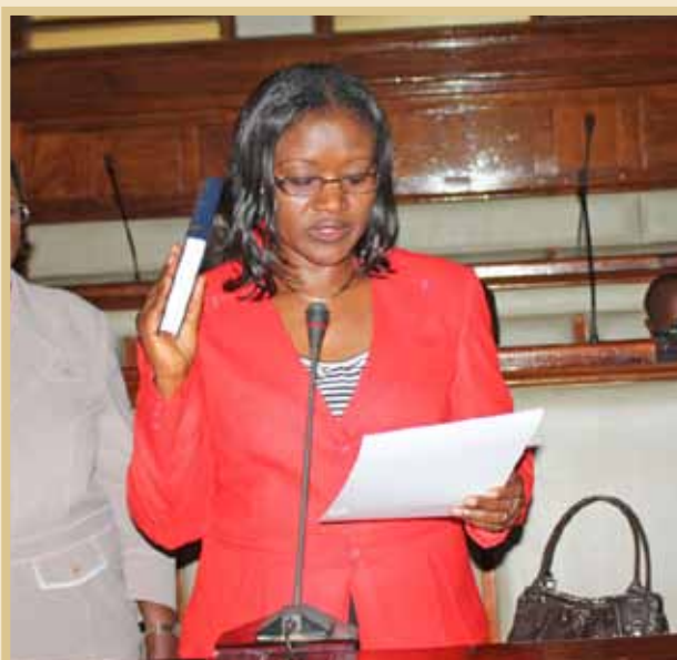
Hon Monique Mukaruliza takes her Oath of Allegiance