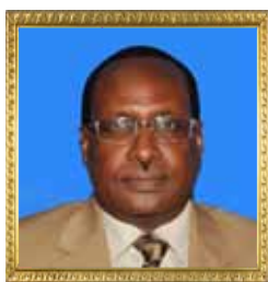
Hon. NKANAE Saoli Ole