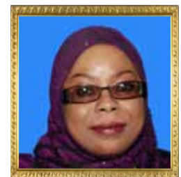
Hon. YAHYA Maryam Ussi