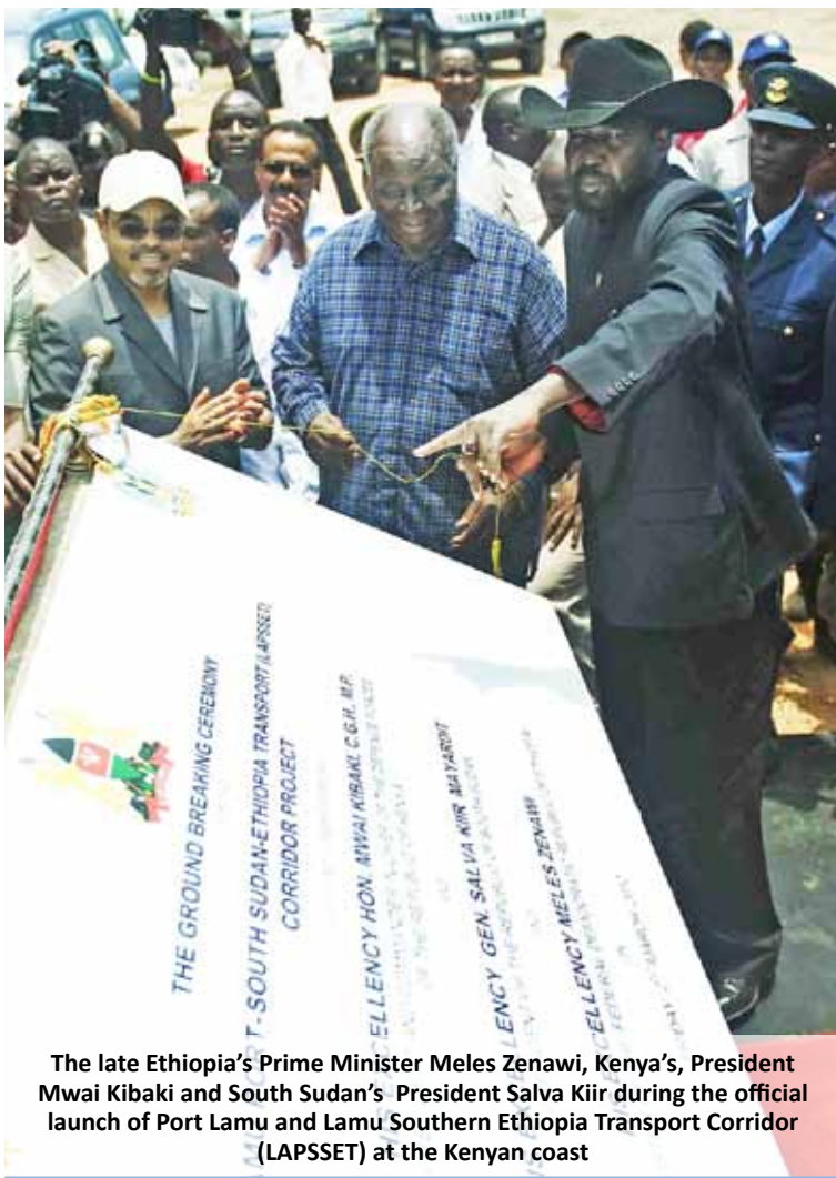
The late Ethiopia’s Prime Minister Meles Zenawi, Kenya’s, President Mwai Kibaki and South Sudan’s President Salva Kiir during the official launch of Port Lamu and Lamu Southern Ethiopia Transport Corridor (LAPSSET) at the Kenyan coast

But by and large, it is incumbent upon the political leadership of the EAC region to borrow a leaf from the late Ethiopian Premier Ato Meles Zenawi: they must initiate and embark on radical and innovative ideas that are bold in design and requiring courage to implement. Our ethnic reality is a combustible mix; we can’t just wish it away!