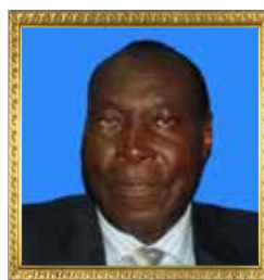
Hon. OMBASA Joseph Kiangoi