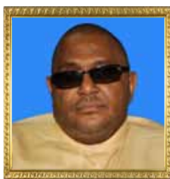
Hon. ABUBAKAR Zein Abubakar