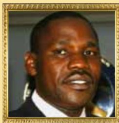
Hon. Peter Munya, Assistant Minister for EAC Affairs (KE)