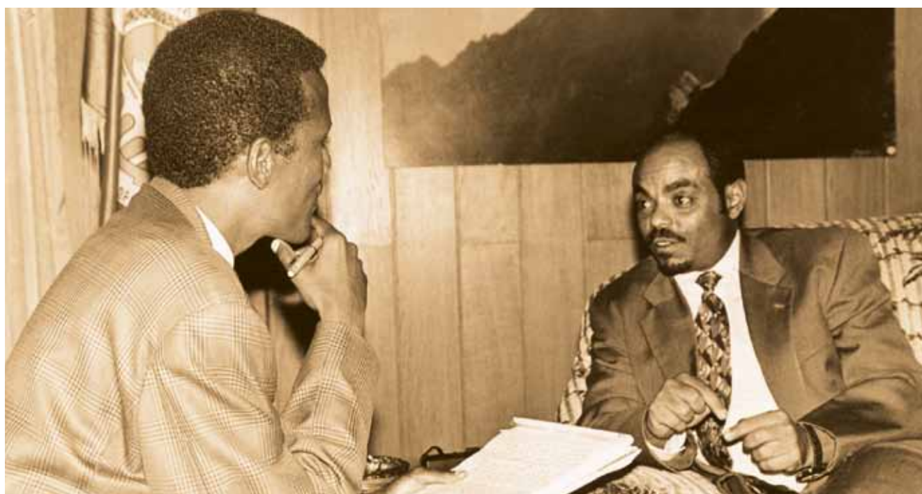
The author of the article during an interview with the Late Ethiopia's Prime Minister

In addition, Premier Zenawi was often accused of leading his military to a reckless and an unusually ruthless incursion into neighbouring Somalia that appeared more like a child's plaything in the guise of pursuing Islamist rebels, thus further destabilising an already broken country. Ethiopia's military expeditions