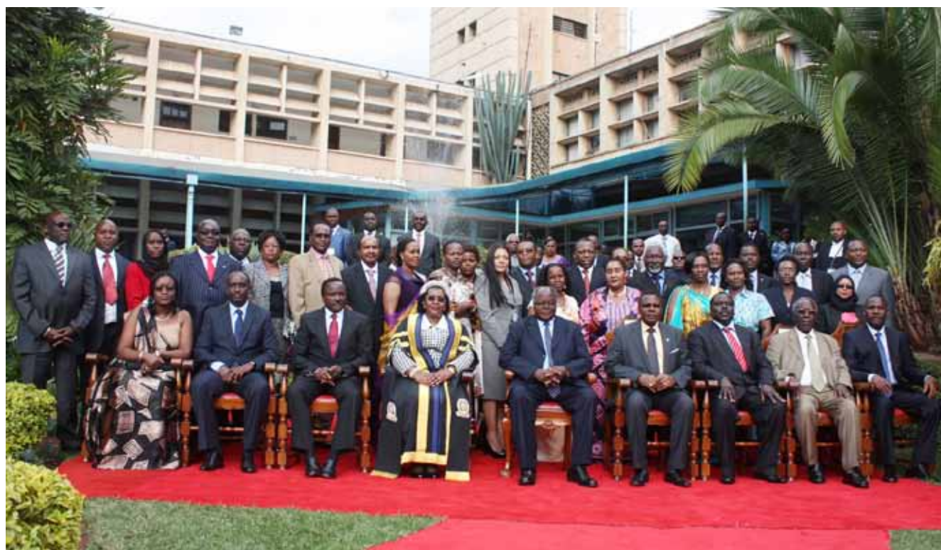
President Mwai Kibaki joins EALA Members for a photo

The next plenary shall be held in Arusha in November 2012.