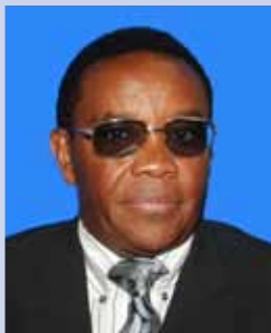
By Hon. Pierre Celestin Rwigema