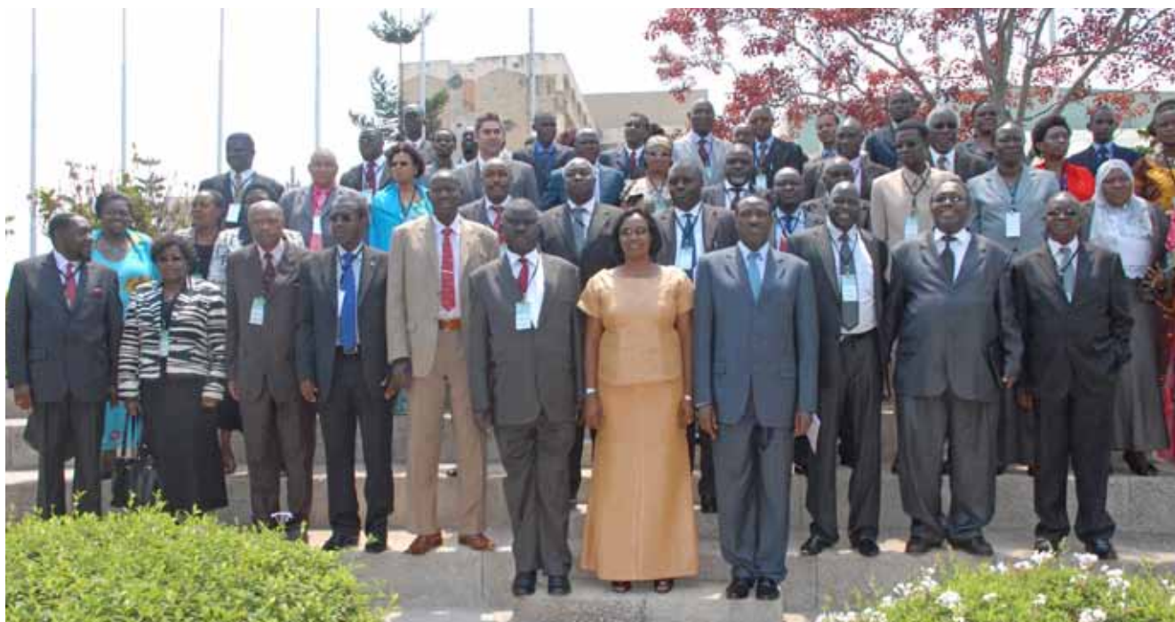
Delegates who attended the EAAPC Meeting in Kigali pose for a group photo

From 17 th to 21 st September 2012, EAAPAC held its 6 th Annual General Meeting and Conference in Kigali, Rwanda.