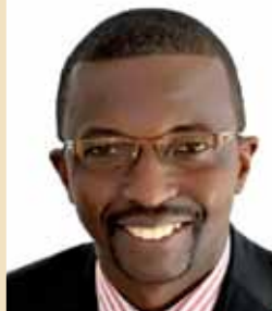
By Bobi Odiko