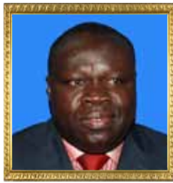
Hon. BAZIVAMO Christophe