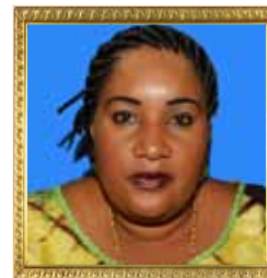
Hon. KIZIGHA Angela Charles