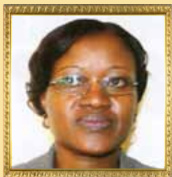
Hon. Monique Mukaruliza, Minister for EAC Affairs (RW)