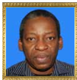
Hon. NYERERE Charles Makongoro