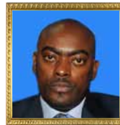
Hon. MUKASA Mbidde Fred