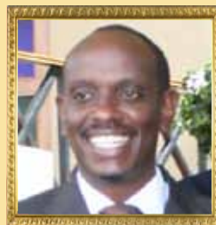
Hon. Amb. Dr. Richard Sezibera, Secretary General – EAC