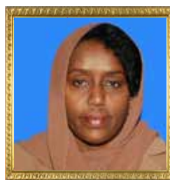
Hon. BONAYA Talaso Sarah