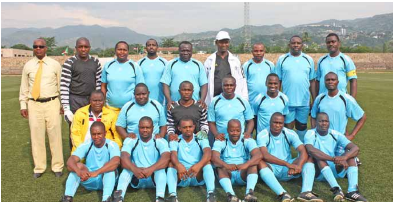
The EALA/EAC team who finished third last year are gunning for the trophy

It is that time again when legislators swop their oratory and debating skills with soccer mastery skills when the Inter-Parliamentary Soccer tournament kicks off. The extravaganza takes place on December 7-14, 2012 in Nairobi, Kenya.