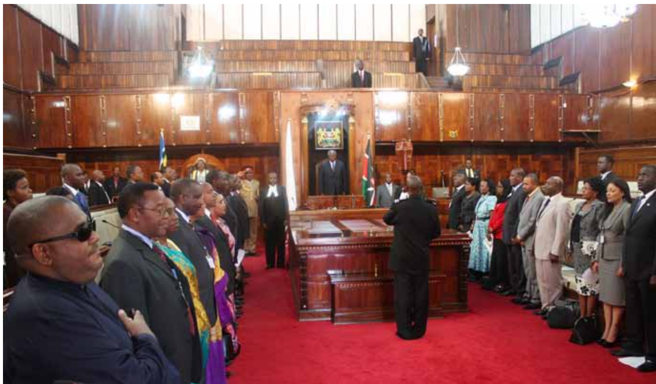
Members stand for the EAC anthem at the beginning of the Plenary in Nairobi

EALA ended its two week Sitting in Nairobi on September 13, 2012 by debating and adopting six Committee Reports and passing four key Resolutions. This was the second meeting of the first Session of the third Assembly.