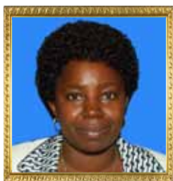
Hon. BUCUMI Emerence