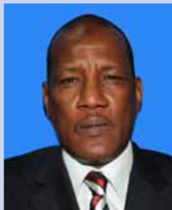
By Hon. Ogle AbuBakr