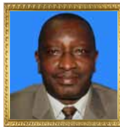
Hon. NGENZEBUHORU Frederic